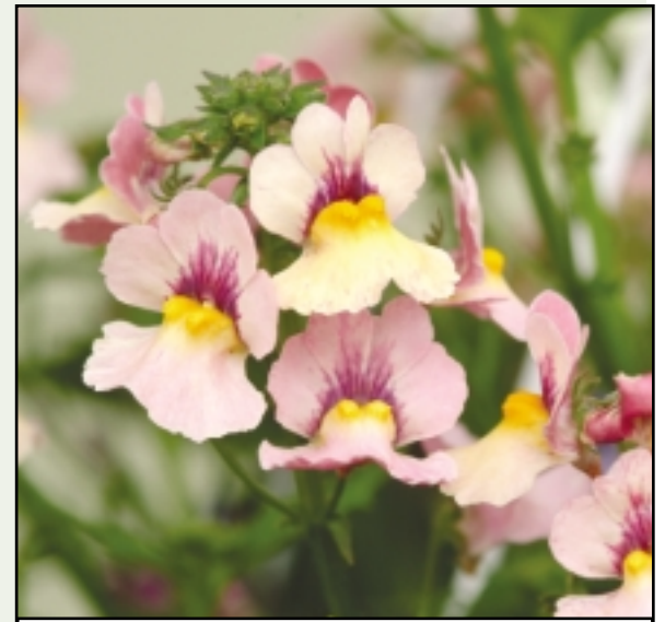
Nemesia 'Sunsatia™ Peach'