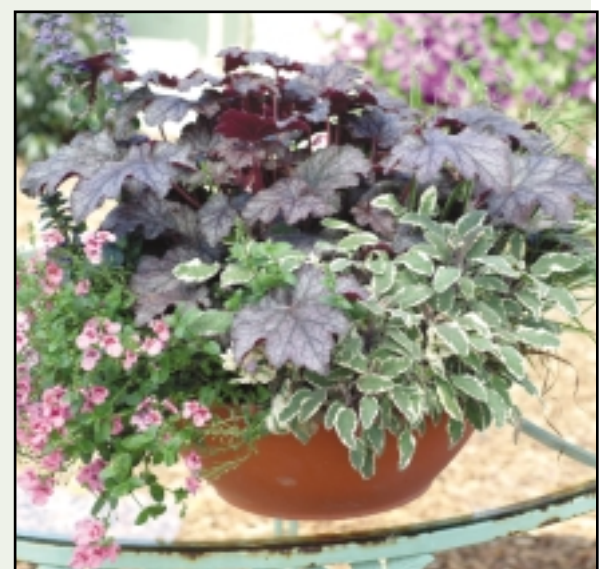
Heuchera 'Amethyst Myst'