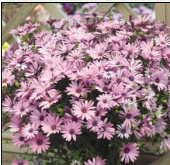
Osteospermum 'Soprano™ Light Purple'

If consumers just can't wait for the threat of frost to pass, using a few of these varieties will satisfy their craving to plant while providing beauty that will last well into summer and beyond.