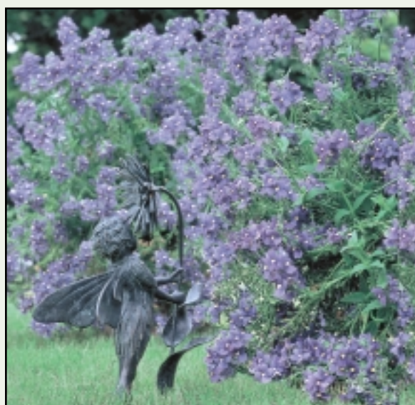
Nemesia 'Safari™ Plum'